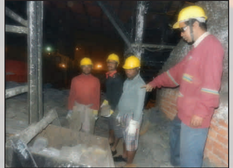
QC / INSPECTION DEPARTMENT