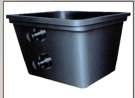
C. I. SLAG POT