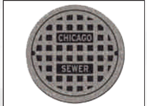
C. I. MANHOLE COVER