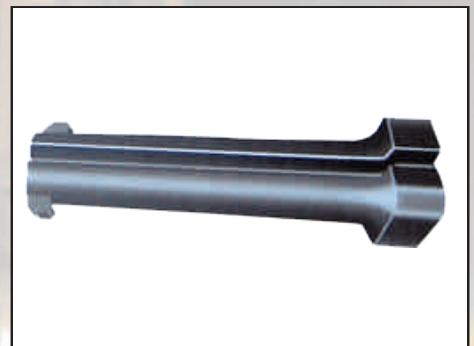
C. I. CENTRE COLUMN