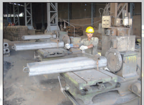
MACHINE SHOP DIVISION