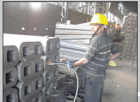
GRINDING & FETTLING DEPARTMENT