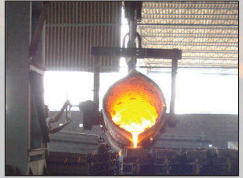
LADLE POURING SECTION

Our Castings are widely appreciated for their high quality standards and durability. These comply to various industrial standards and are tested on various parameters before being supplied to the clients.