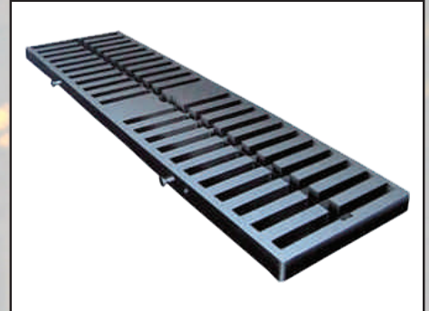
C. I. BOTTOM PLATE