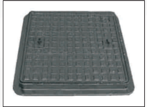
C. I. MANHOLE COVER

To charge as an Indian brand & deliver exceptional custom made products across the globe. This will be achieved by creating mutually beneficial relationship with our customers, suppliers, employers, bankers etc.